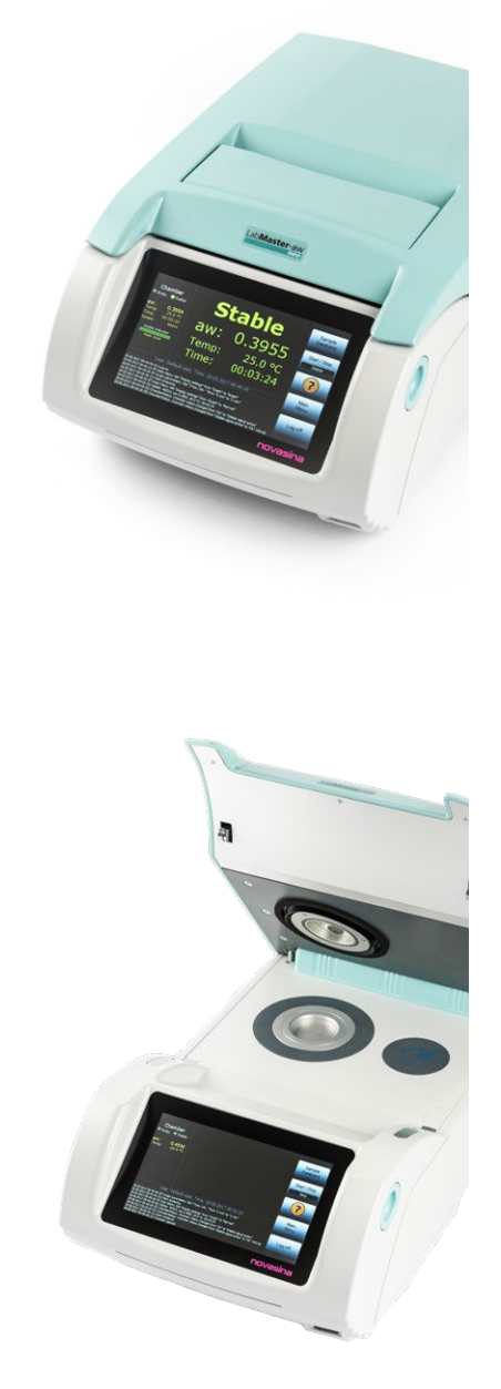
LabMaster aw-neo Most reliable water activity meter on the market

For green coffee, water activity is measured by equilibrating the liquid phase water in the sample with the vapor phase water in the headspace of a closed chamber and measuring the Equilibrium Relative Humidity (ERH) in the headspace using a sensor. The relative humidity can be determined using a resistive electrolytic sensor, a chilled mirror sensor, or a capacitive hygroscopic polymer sensor. Instruments from Novasina, like the Labmaster NEO, utilize an electrolytic sensor to determine the ERH inside a sealed chamber containing the sample. Changes in ERH are tracked by changes in the electrical resistance of the electrolyte sensor. The advantage of this approach is that it is very stable and resistant to inaccurate readings due to contamination, a particular weakness of the chilled mirror sensor. The resistive electrolytic sensor can achieve the highest level of accuracy and precision with no maintenance and infrequent calibration. Coffee beans can be tested whole or crushed with crushing providing advantages in testing time and repeatability.