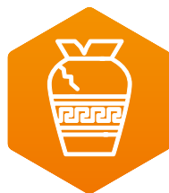
Art Conservation Studios